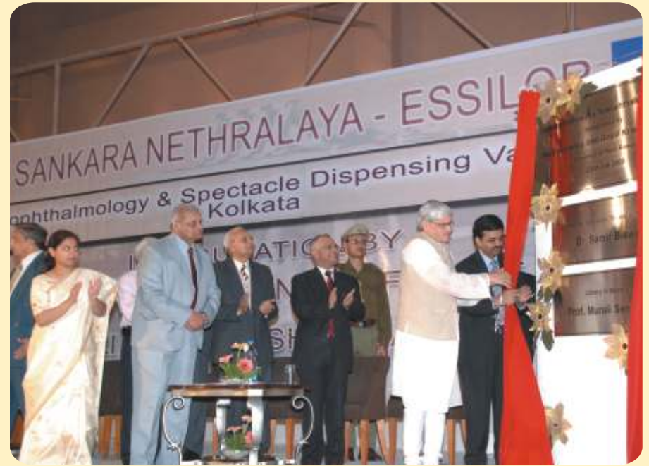
West Bengal Governor Shri. Gopalkrishna Gandhi inaugurating the hospital's teleophthalmology facility on January 23, 2009 in Kolkata.