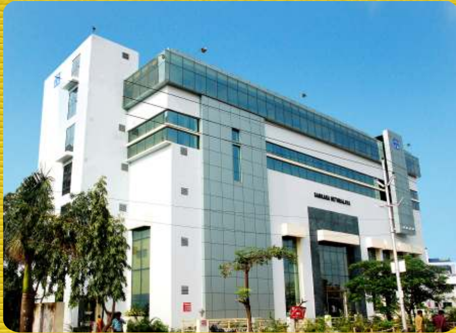
Sankara Nethralaya - Kolkata