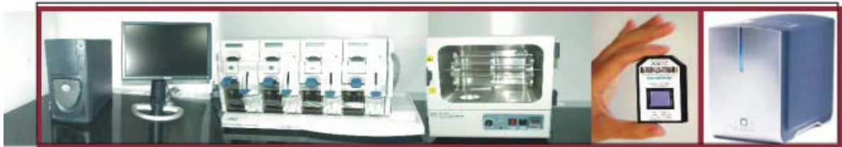
Affymetrix GeneChip 3000 7G targeted genotyping system (DNA microarray).