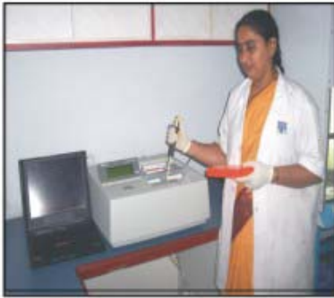
ABI PRISM 6100 Nucleic acid preparation station