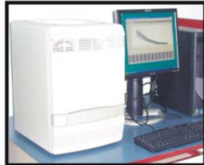
ABI PRISM 7300 Real time PCR system