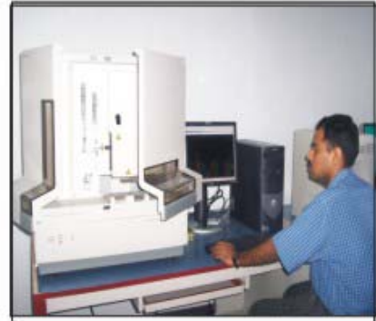
ABI PRISM 3100 AVANT genetic analyzer