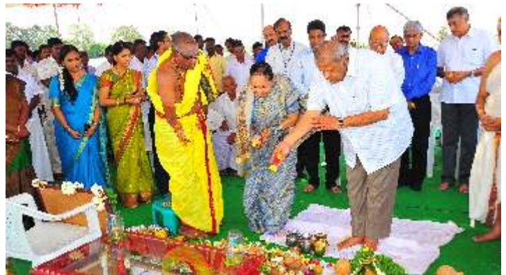
Bhumi Puja at Sri City