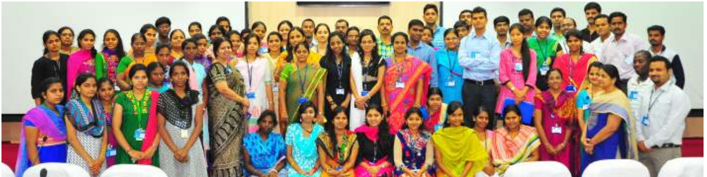
Participants at the Nethra Vidya

The first session of the Continuing Optometry Education (COE) Nethra Vidya Series 3 for the year 2016 was conducted on 31st January, 2016 at Sri V.D.Swami Auditorium, K.N.BIRVO Block.