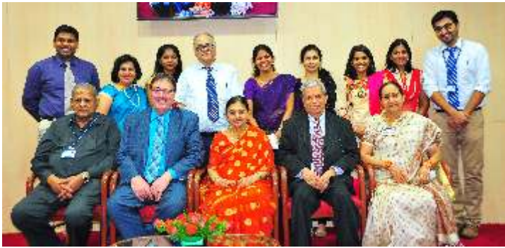
Delegates at Dr.Nagamani Dharmapuri Endowment lecture