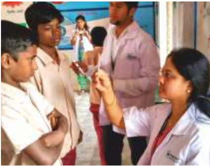
ESO observes World Optometry day at Karumanthurai

As part of World Optometry Day celebration 118 students of Elite School of Optometry, academic arm of Sankara Nethralaya accompanied by 4 faculty members and an administrator visited a tribal village named Karumanthurai, in the inaccessible Kalvarayan hills in Salem district. The team spent 4 days from the 28th of February to 2nd of March 2016, engaging in various eye care related activities with the socially and economically backward population who had little access to quality Medicare.