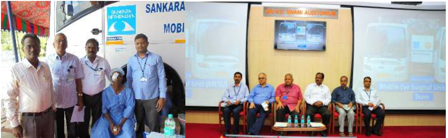
Dignitaries from Madras Atomic Power Station, Kalpakkam along with Sankara Nethralaya team at the function

The Sri V.D. Swami auditorium at the Sankara Nethralaya came alive to a lot of jubilation and adulatory observations on the institution's revolutionary community ophthalmology initiative by senior officials of the Madras Atomic Power Station (MAPS) Kalpakkam, on the 6th of April 2016. The occasion was the felicitation and honouring of the team operating the 'Mobile Eye Surgical Unit,' which had performed a high number of Cataract surgeries, benefiting villagers surrounding the Kalpakkam plant, as part of the Corporate Social Responsibility (CSR) of the Power Station.