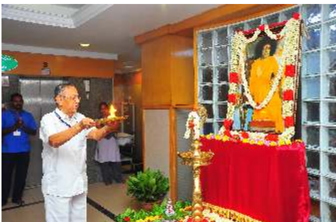
Sri Satya Saibaba Aradhana at SN

Aradhana of the highly revered and globally adored spiritual leader and humanist par excellence Sathya Sai Baba whose life and message continue to inspire millions of people to lead more purposeful lives through his timeless and universal teachings, was observed at Sankara Nethralaya with fervour and spirit of service by employees, volunteers and devotees of Sri Sathya Sai Baba, amidst chanting of Bhajans and Keerthans on 25th April 2016.