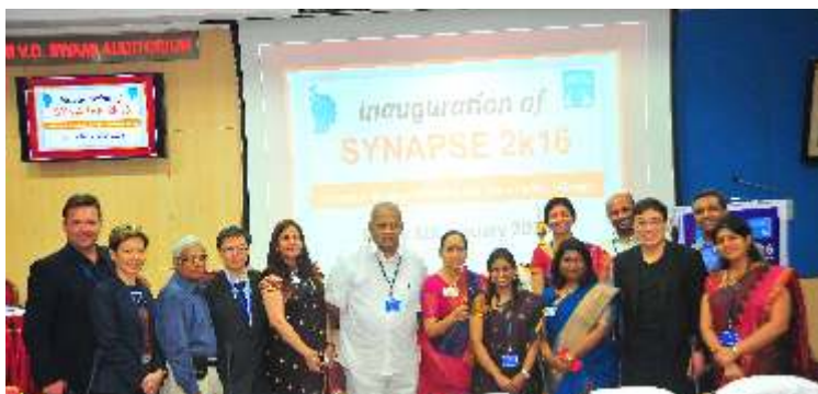
Delegates at the Synapse 2k16 conference