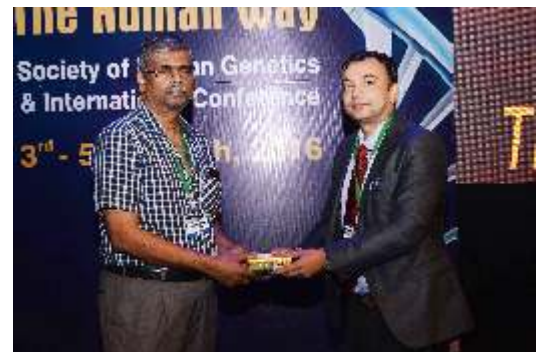
Dignitaries at the ISHG 2016 meet